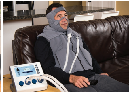
HEAD AND NECK