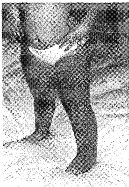
A 3-year-old child with lymphedema wears an Elvarex garment.

The application of compression garments is often very difficult or even impossible during the first few years of life. It is realistic to assume that the first garment