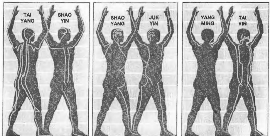
FIGURE 1. The acupuncture meridians form a series of channels through which Chi — life energy — flows. The acupuncture points are effective stimulation sites along these channels.

educated in the unique vulnerability of lymphedema patients. Through aggressive, soft-tissue manipulation or vigorous and sustained muscle recruitment, lymphedema patients may be unwittingly harmed. Nonetheless, non-western therapies that fall within accepted explanatory models usually do not meet with opposition. Uncertainty and clinical concern arise when putative mechanisms of action deviate from established paradigms. Many non-western therapies account for their clinical effects through their capacity to influence the body's energy flow. Vocabulary varies across different systems (Prana – Ayurveda/ Yoga, Chi – Chinese medicine, Ki – Japanese medicine), however, all energy-based, non-western traditions refer to a unifying, all-pervasive, life giving and sustaining energy which is essential for health. In addition to ancient, non-western medical systems, new "energy medicine"