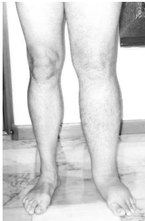
FIGURE 6. Stage II: Spontaneously Irreversible Lymphedema of the Lower Extremity.

Lymphedema of the breast is an often overlooked side effect of breast cancer treatment. The causes of