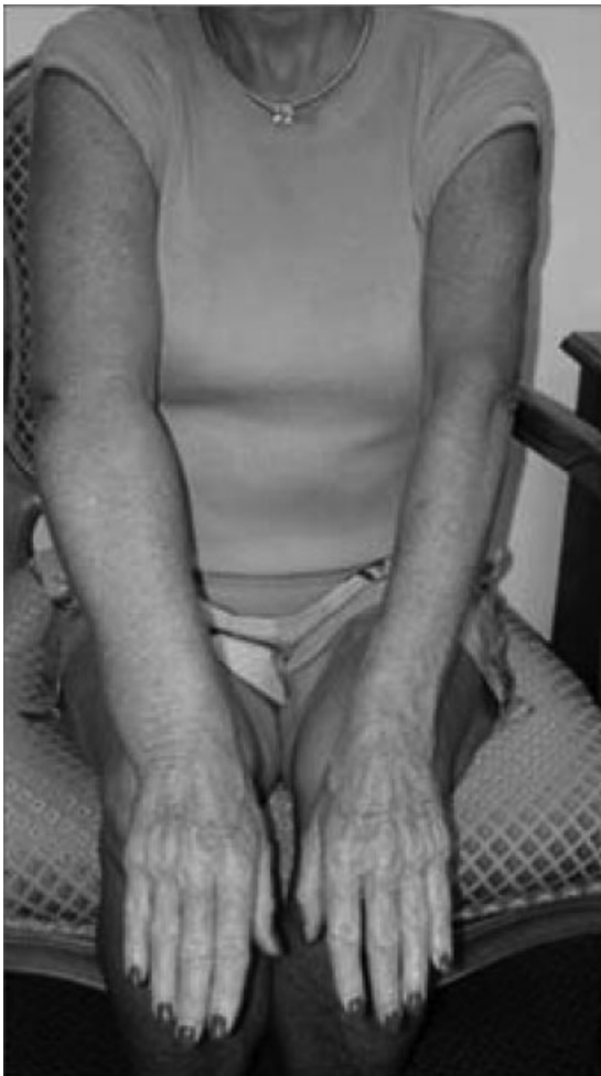
FIGURE 3. Stage I: Reversible Lymphedema of the Upper Extremity.

Stage II lymphedema, also called “spontaneously irreversible lymphedema,” (Figs. 5 and 6) presents with intradermal fibrosis that decreases tissue suppleness and reduces the ability of the skin to indent (“pit”) with pressure. Applying firm pressure into the tissue for at least 5 seconds assesses pitting edema. 7 If an indentation remains after the pressure is released, pitting edema is present. It is measured on a scale of 0 to 3+, in which 0 indicates not present, 1+ indicates minimal, 2+ indicates moderate, and 3+ indicates severe pitting edema. 7 In this stage, resolution of clinically evident lymphedema is not possible with elevation. 1 The patient will often present with a positive Stemmer sign, in which the skin of the dorsum of the fingers and toes cannot be lifted, or lifted with difficulty, compared with the uninvolved limb. 1 Skin infections are more common in this stage, due to the