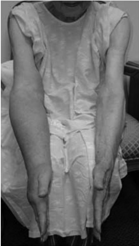
FIGURE 5. Stage II: Spontaneously Irreversible Lymphedema of the Upper Extremity.

becomes more prominent. 1 Recurrent bacterial and fungal infections of the skin and nails are more common in this stage of lymphedema. 1 In Stage II and Stage III lymphedema, the formation of adipose tissue is mainly responsible for the excess volume in swollen limbs that do not present with pitting. 8,9