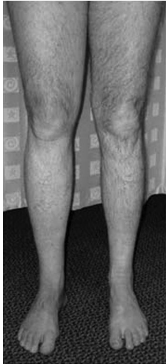
FIGURE 4. Stage I: Reversible Lymphedema of the Lower Extremity.

diminished ability of the immune system to respond to foreign bacteria and debris. Infections can predispose the affected lymphatic channels to both an increased lymphatic load due to the inflammatory response and decreased transport capacity, potentially leading to Stage III disease. 1