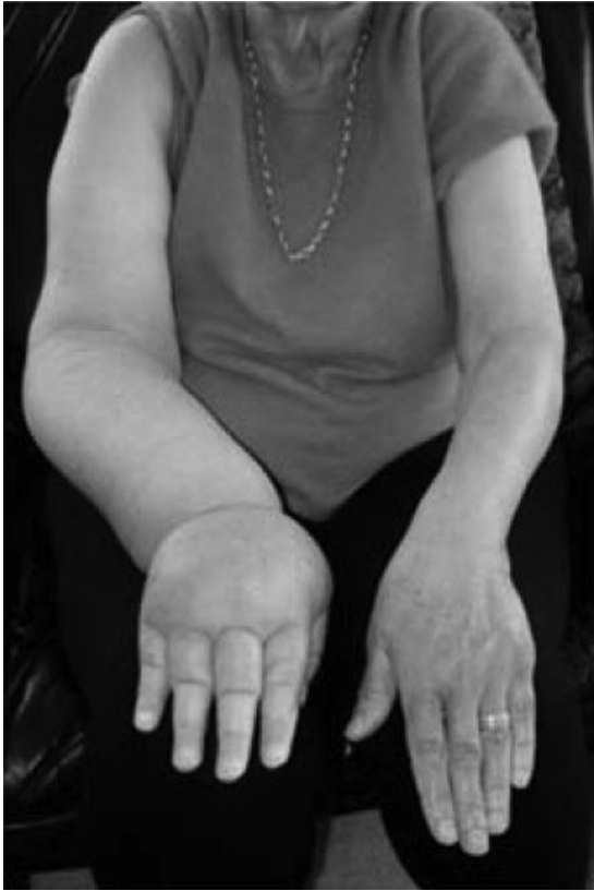
FIGURE 7. Stage III: Lymphostatic Elephantiasis of the Upper Extremity.

breast lymphedema include surgery, radiation therapy, malignancy, and, rarely, heart failure. 36-38 Although this mechanical insufficiency can be due to the development of scar tissue from surgery or radiation therapy blocking the lymphatic pathways, tumor blockage can also disrupt lymph flow, leading to the clinical presentation of lymphedema. Breast lymphedema occurs most commonly in patients who have undergone both axillary radiation therapy and surgery 39 ; when both surgery and radiation therapy are performed, the frequency of breast edema ranges from 6% to 48%. 27,40,41 If a lumpectomy is performed alone, the frequency is approximately 6%. 40 A drastic increase in incidence is noted when a lymph node dissection and radiation therapy are performed. With a sentinel lymph node biopsy (SLNB) and radiation therapy, the frequency of breast lymphedema rises to 23%. 41 If the patient undergoes an axillary lymph node dissection (ALND) with radiation therapy, the lymph node status may affect the development of lymphedema (35% in lymph node-negative patients and 48% in lymph node-positive patients). 41 Factors that are reported to significantly increase