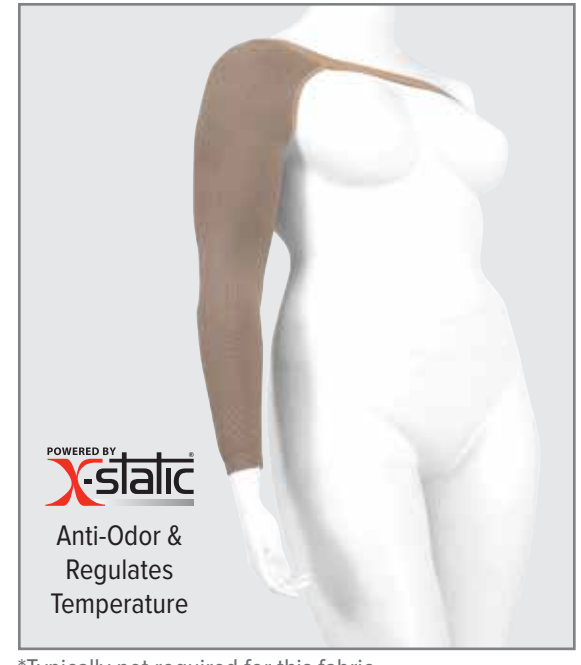
*Typically not required for this fabric

Juzo Silver Garments should be removed prior to MRI Scans & Cardiac Defibrillations.