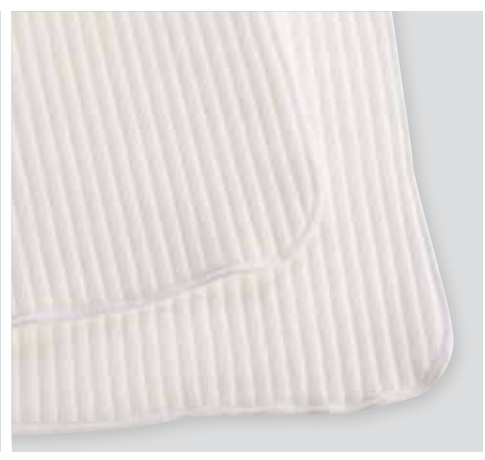
6835 SoftCompress compression sheet