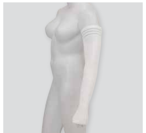
SoftCompress liner available in standard sizes. Includes hand and elbow pads.