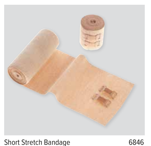
Short Stretch Bandage