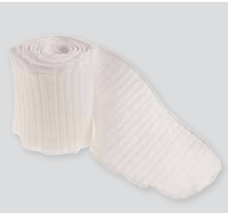
6831 SoftCompress compression roll