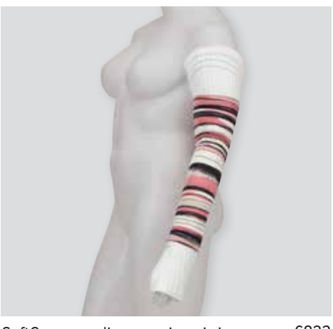
6822 SoftCompress liner arm in uni size. Includes decorative cover, a hand pad and an elbow pad.