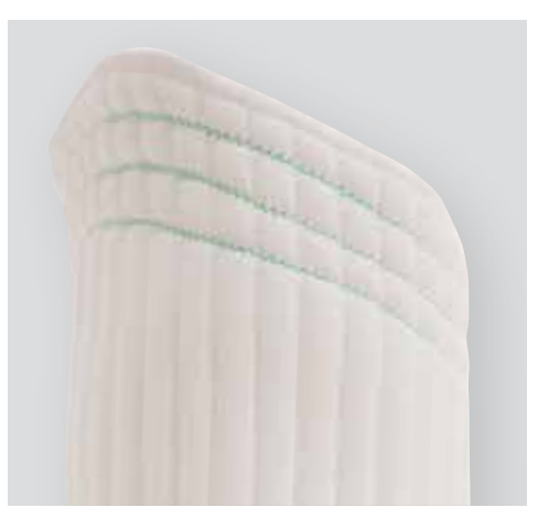
6823 Standard and uni sizes can be cut according to the cutting marks to adjust length.