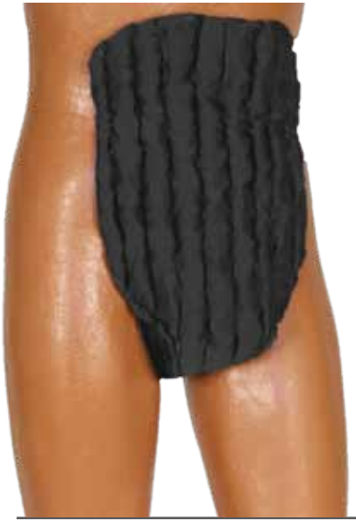
GeniFit™ Male High Cut Pad

10 - 15 mmHg | Comfortable, Mild Compression for Genital Edema