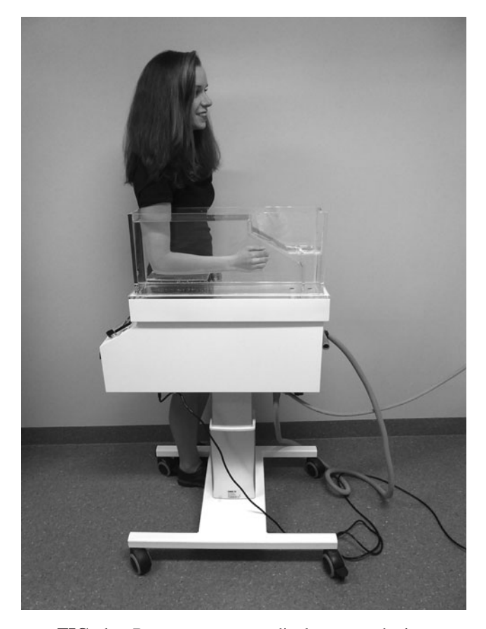
FIG. 1. Bravometer water displacement device.

This device enables a straightforward use and it is painless for the patient. The water basin was filled up with lukewarm water by the researcher. Participants were asked to slightly immerse their hand and arm into the Bravometer and the water overflow was measured.<sup>12–18</sup> Using a marker, dots were placed on the arm at the level of the water surface, thereby marking the edge of the measured arm volume. After each measurement, the water basin was refilled with fresh water before the next measurement (Fig. 1).