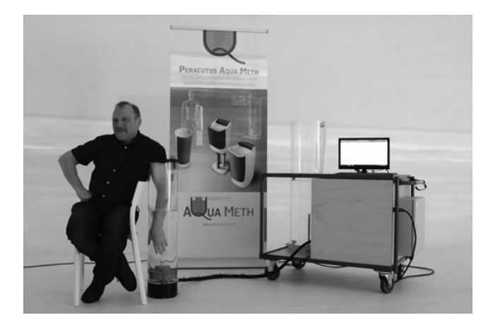
FIG. 2. First prototype of the PAM. PAM, Peracutus Aqua Meth.

the pumped water is calculated at each specific height. Hence, the increase (or decrease) of the water level in the measuring unit at each time interval is a measure for the cross-sectional area of the arm at the specific height, i.e., position on the arm. The cross-sectional area of the arm at approximately each 0.7 mm is determined.