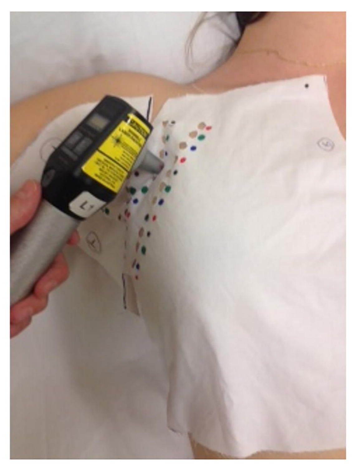
Fig. 2 Laser treatment applied with the patient in supine, affected arm abducted to 90^{\circ}

sessions depending on the time frame needed to achieve clinical goals. The dose per application site was 1.5 J per centimeter squared (J/cm2), for a total dose of 15 J/cm2 delivered at each treatment session.