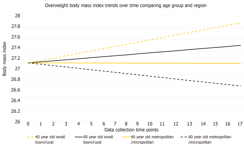
Figure 2 Overweight body mass index trends over time comparing age group and region. The estimated body mass index (BMI) trajectory for four women whose BMI falls in the overweight range are shown in this graph. They all started with a BMI of 27, a weight of 158 lbs and height of 5'4. The model was designed so the reference groups were \geq 55 years old a living in a small town or rural region. A woman falling in these two groups is represented by the solid black line (average expected gain in BMI of 0.30 kg/m 2 ).