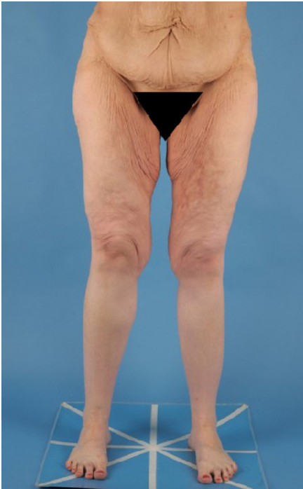
Fig. 8 Lipoedema patient who lost 65 kg in weight within 14 months of a sleeve gastrectomy (Fig. 8 and Fig. 9: shown with the permission of Prof. Dr. N. Torio, Freiburg).