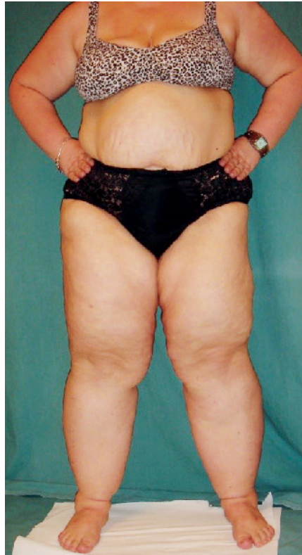
Fig. 1 Lipoedema patient (weight 122 kg, height 168 cm, BMI 43 kg/m 2 ) before sleeve gastrectomy. The volume of each leg was 19 litres).

However, if obese patients prepared to undergo a bariatric procedure are compared with a group of obese patients from the population, then the two groups do not differ with regard to their self-harming