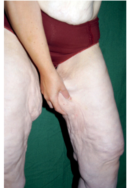
Fig. 7 Patient from Fig. 5, one year later. Excess skin with subcutaneous fat.

behaviour or the frequency of attempted suicides (95). The alleged increased suicidality is therefore not – as is often wrongly assumed – the result of the bariatric surgery, but much rather the consequence of the increased psychological vulnerability of the group of patients with severe obesity.