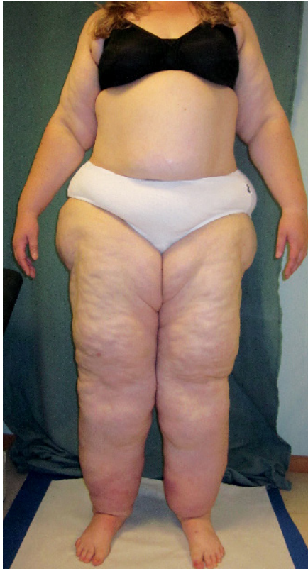
Fig. 5 Patient with lipoedema and meanwhile also predominantly distal leg oedema.