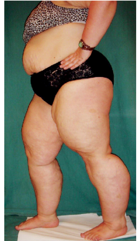
Fig. 2 Lipoedema patient (weight 122 kg, height 168 cm, BMI 43 kg/m 2 ) before sleeve gastrectomy. The volume of each leg was 19 litres).