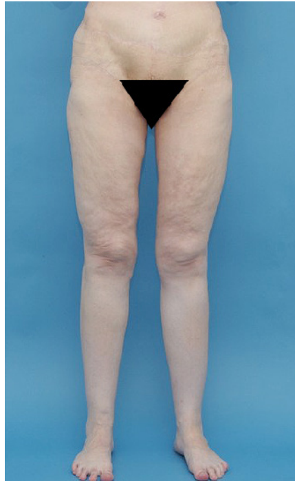
Fig. 9 After weight stabilisation of just 1 year, the hanging belly in the genital region and the loose thigh skin were tightened by plastic surgeons.