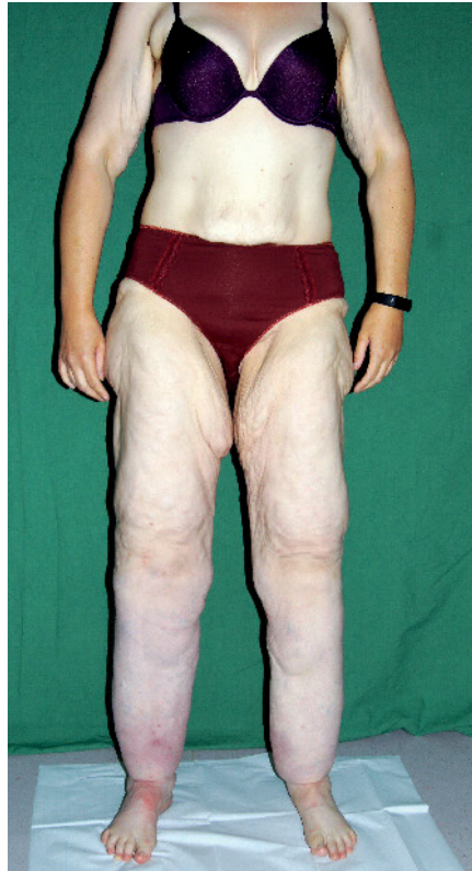
Fig. 6 Patient from Fig. 5, one year later, after a gastric bypass.