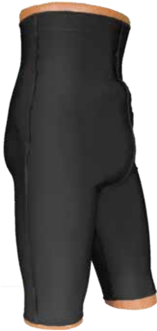
CompreShorts™ (shown with male low-cut GeniFit™ pad)

10 - 15 mmHg | Comfortable support & Mild Compression